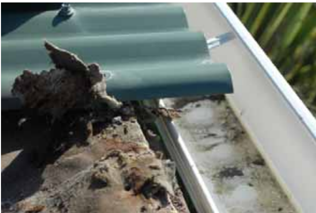
Gutter is installed incorrectly, paper has been rotted away, netting has rusted away, ARX™ has been perforated as a result.