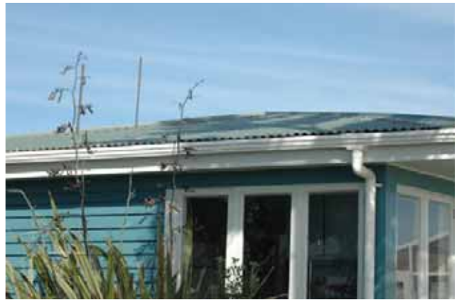
Gutter installed well below profile line, so it doesn't stop salt and contaminant laden air from being blown under the roof.