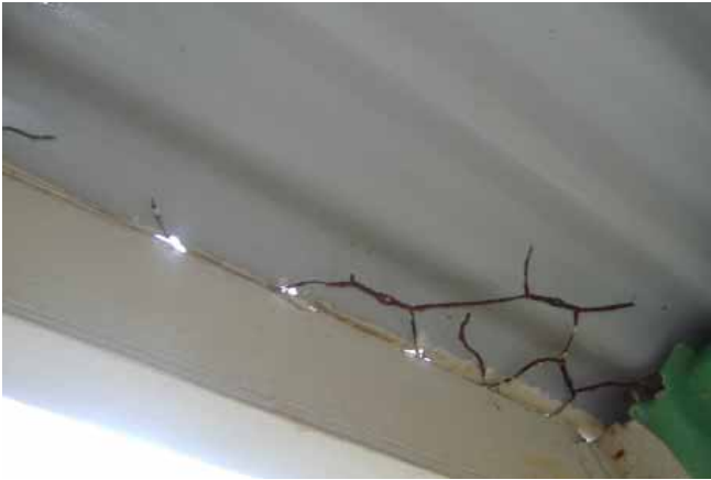
Paper has rotted away, netting has corroded, ARX™ has perforated as a result.