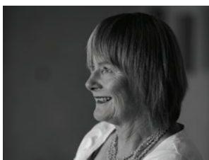
Lindley Naismith SCARLET ARCHITECTS, AUCKLAND